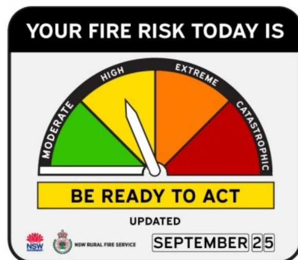
Fire Danger Rating sign

For further information on the Australian Fire Danger Rating System.