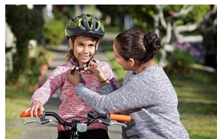
Wearing a helmet when riding a bike in a public place is the law.