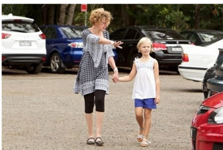
Car parks can look different in holiday areas.