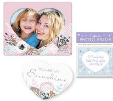
MAGNETIC PHOTO FRAME