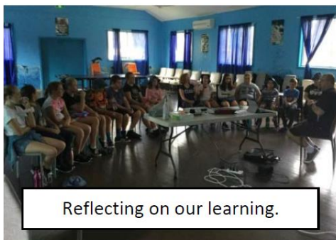
Reflecting on our learning.