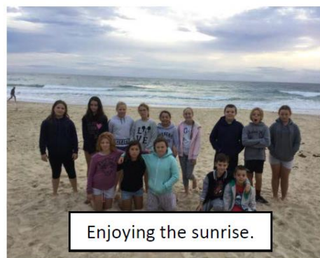
Enjoying the sunrise.