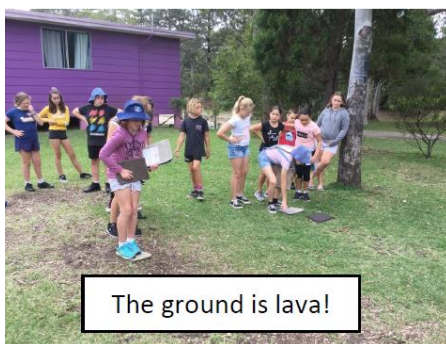
The ground is lava!