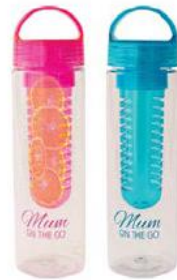
WATER BOTTLE INFUSER