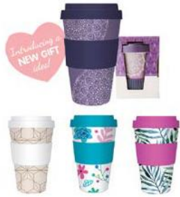
BAMBOO FIBRE COFFEE CUP