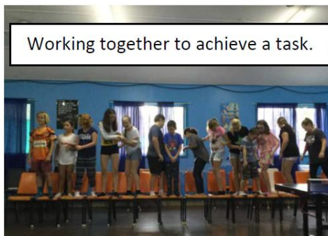
Working together to achieve a task.