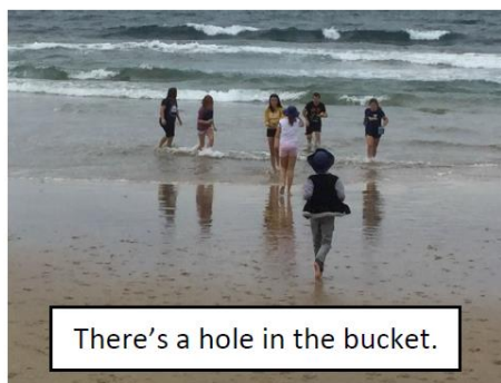
There's a hole in the bucket.