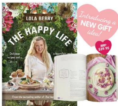
LOLA BERRY RECIPE BOOK