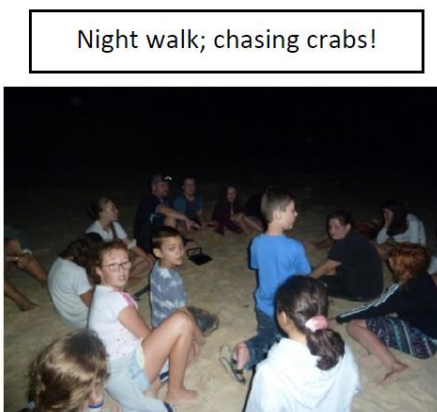
Night walk; chasing crabs!