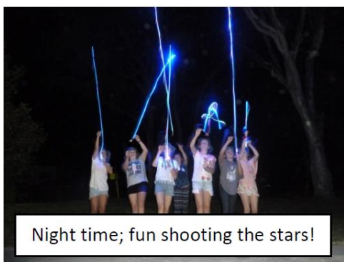
Night time; fun shooting the stars!