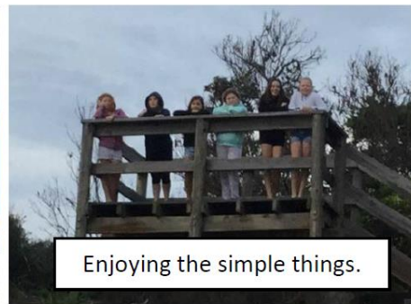
Enjoying the simple things.