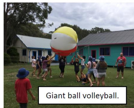
Giant ball volleyball.